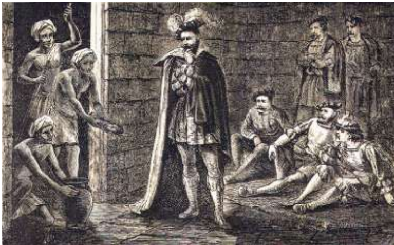
VASCO DA GAMA A PRISONER.