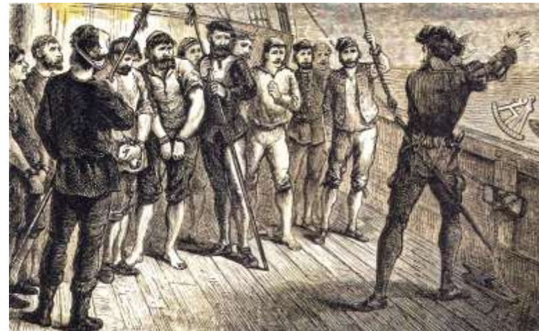
VASCO DA GAMA QUELLS A MUTINY.

This firm conduct completely subdued the rebellious disposition of the crew, who hastened to crave the captain's pardon for their mutinous designs. They begged him to release the men in irons; but to this he turned a deaf ear. He took up his station at the pilot's place, and himself undertook to guide the ship on its perilous way.