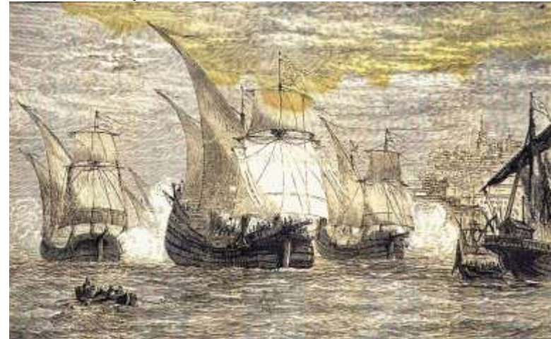
VASCO DE GAMA SETS SAIL.

His story, as will be seen, is full of striking incidents, of strange adventures, of desperate dangers, and of moving triumphs. Few voyages have been more replete with romance; and his career is now narrated for the first time for the benefit of youthful readers, in the hope that it will amuse some of their leisure-hours, and at the same time afford them an important lesson in history.