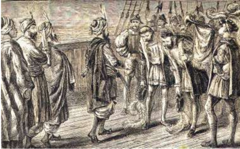
VISIT OF THE SHEIK OF MOZAMBIQUE.

After the sheik had taken a good look at the ship and its company, he began to speak in Arabic; and the Moor Davane slowly translated what he said to Vasco, and also what Vasco replied to the sheik. The following conversation took place:—