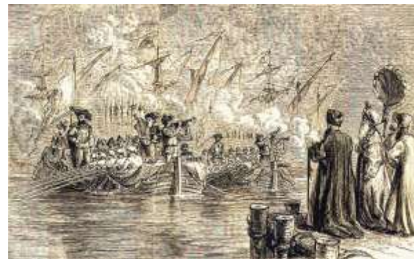
VASCO VISITS THE KING OF MELINDA.

of the roadstead glistened in the sun's rays. The town was all alive with gayly-dressed people, who thronged along the quays, and covered the reef with a dense and excited mass. The walls of the town, the caravels, and the ships anchored near, were gay with flags, standards, and streamers, fluttering in the light breeze; and the country round about was clothed in the luxuriant green and ample foliage of the African spring-time. The two boats, as they started away from the ships, were a sight to behold. Vasco and Paulo, attired in cloaks of crimson satin, with plumed caps, and swords, sat upon chairs covered with crimson velvet; while beneath their feet were spread brilliantly-colored Carpets. Over the sides of the boats hung woollen rugs, on which sat the men who had been chosen as the retinues of the two captains. Each boat carried two cannon, loaded, and pointed outwards; and from each floated the royal standard of Portugal.