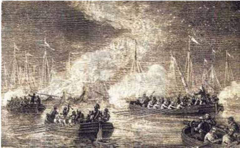
THE ATTACK ON THE GOA BOATS.

hid themselves in the brush on the little islands near by. A number of those swimming were killed on the spot by the Portuguese cannon and the cross-bows: others were caught on the islands, and despatched without mercy. Then the boats were all taken in tow, and carried back to the San Gabriel . In them were found stores of fish, rice, and cocoanuts, besides small cannon, javelins, swords, bucklers, and bows, with arrows made of cane, terminating in long, broad iron points.