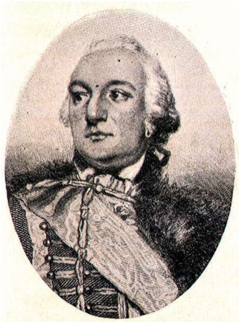
DUKE OF ORLEANS

From Wednesday to Sunday the voting was protracted, each deputy mounting to the steps, where he gave his verdict as to guilt and punishment. The wintry dusk was succeeded by night and again by dawn, and all France, all Europe waited. Banishment was the pronouncement of many, and imprisonment till the war was over satisfied the patriotism of certain of the Girondins; but some voices decreed death, and