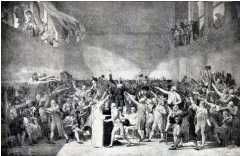
THE OATH OF THE TENNIS COURT.

The next day the nobility and clergy retired to a separate apartment to "verify their powers," a ceremony which was necessary before their deliberations could have weight. The six hundred left alone realized that double representation was not all that they had to gain. They determined to demand that the Three Estates should be merged in one for the business which France gave them to perform. A feeling of impatience agitated the vast Salle des Menus where spectators thronged to hear the speeches of the deputies. There was famine in the provinces because bread was sold to the poor at a ruinous price. These representatives of the people could do nothing to help those who had elected them till their powers were verified. The noblest reformers fretted at the delay and heard speeches with impatience, for the nation needed more than words. Pamphlets issued from the Press defending the claim of the Third Estate, and orators in the Palais Royal were clamorous, denouncing the obstinacy of the nobility and clergy who still held aloof.