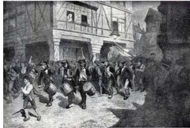
THE NIGHT OF THE 10TH OF AUGUST, 1792.

Swiftly the Marseillais followed the soldiers who fled before them. One or two fell before reaching the drawbridge of the Tuileries and knew no more of jealousy or revolution. The rest gained their quarters in safety, and were on the alert for the next move of Paris with its new force for action. The Swiss were the most reliable protectors of royalty, men as fearless as lions though they were but paid mercenaries. Their discipline was perfection. Louis could rely on them to obey orders, and felt that under Mandat, their leader, any attack on the Tuileries would be well opposed. He had in all about 6600 men in the palace.