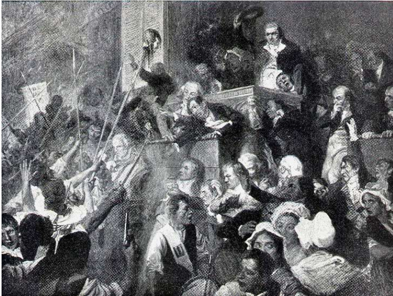
THE RISING OF THE PRAIRIAL.

escape might be easier. The decrees of the Sixty were declared null, and the Sixty put on trial and sentenced to the guillotine. Those members who were left did not incline to mercy. They ordered Billaud and Collot to be tried for life, but found that they had been already shipped from France to their place of exile.