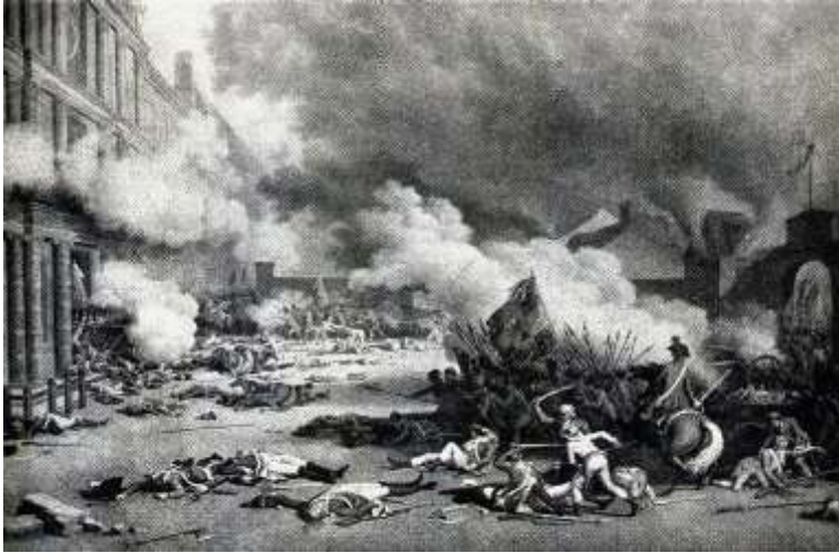
THE TAKING OF THE TUILERIES.

making him enter into games of battledore and shuttlecock, and seeking to diversify the walks in the horse-chestnut alley by quoits or football when running was too wearisome.