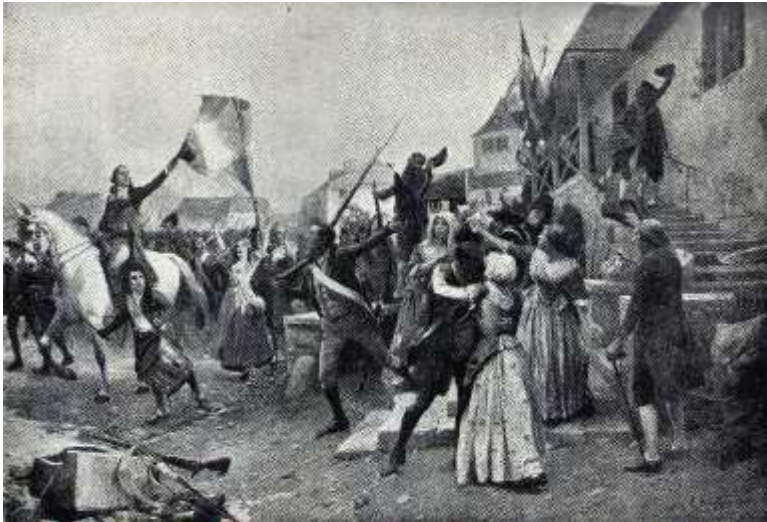
THE DEPARTURE OF THE VOLUNTEERS.

fell by the wayside but were all ready at the end of that amazing march to answer to their names.