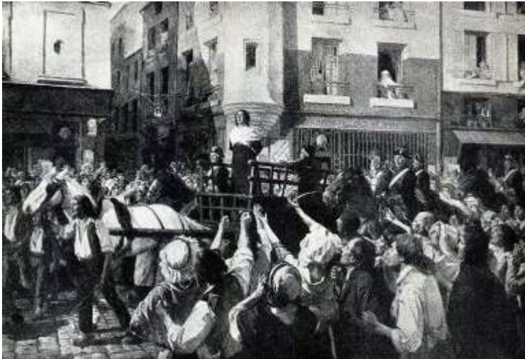
CHARLOTTE CORDAY TAKEN TO EXECUTION.

She might not knit, since the use of needles was forbidden. Steel was dangerous, and messages could be conveyed by stitches, as the women of the people knew too well during the time of the Terror. They took their knitting with them to the public trials of the aristocrats they rejoiced to see fallen. They were said, in some cases, to have recorded the names of those to whom death should be meted out during the years preceding Revolution. It had been the safest way of keeping secret evidence against their oppressors. Terrible were the results of some apparently harmless piece of work, made by the busy hand of a peasant or merchant's wife. The Queen should not avail herself of a like method to communicate with her enemies. Austria would have her if the jailers did not look well to the royal bird they had caged at last.