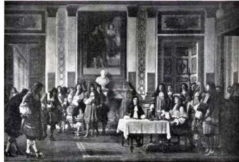
MOLIERE SUPPING WITH LOUIS XIV.

the King and led him to the terrace to describe the vast wilderness beyond, Louis XIV interrupted him constantly, exclaiming, "Le Notre, I give you 20,000 francs." But the gardener was not avaricious. He stopped in vexation and declared, "Sire, your Majesty shall hear no more. I should ruin you."