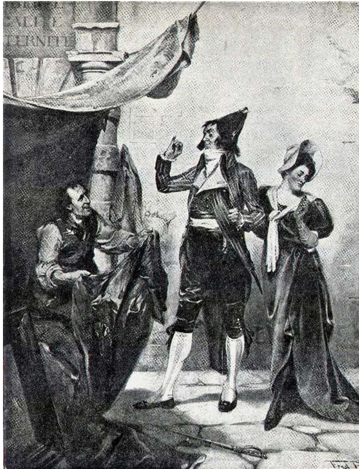
RELICS OF THE REVOLUTION.

rejoin her in Spain at a very undignified residence, which was all the King placed at the disposal of his cousin.