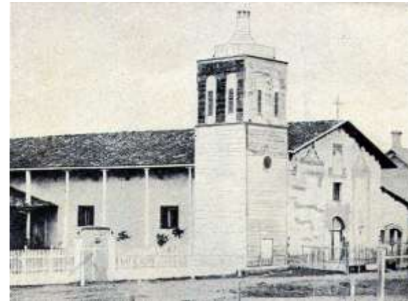
MISSION OF SANTA CLARA

The best account left us of the mission establishment in its palmy days is that given by De Mofras in his careful record of travel and exploration along the Pacific Coast; and often quoted as this has been, we still cannot do better here than to translate some portions of it anew. The observant Frenchman wrote with his eye mainly upon what was perhaps the most completely typical of all the missions—that of San Luis Rey. But his description, though containing a number of merely local particulars, was intended to be general and for this reason may the more properly be reproduced in this place.