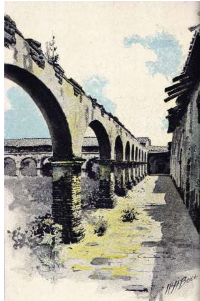
MISSION OF SAN JUAN CAPISTRANO

himself; a lieutenant in charge of a company of soldiers; a missionary; the captain, pilot and surgeon; twenty-five soldiers; the officers and crew of the ship, twenty-five in all; the baker, the cook and two assistants; and two blacksmiths: total, sixty-two souls. An inventory shows that the vessel was provisioned for eight months.