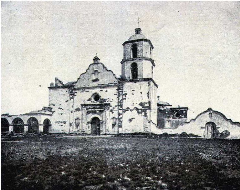
MISSION OF SAN LUIS REY.

Not unless we wish to emulate Southey's learned friend, who wrote whole volumes of hypothetical history in the subjunctive mood, it is hardly necessary for present purposes to discuss the internal changes which, had the missions been left to themselves, might in the long run have brought about their decay. For as a matter of fact the missions were not left to themselves. The closing chapter of their history, to which we have now to turn, is mainly concerned, not with their spiritual management, or with their success or failure in the work, they had been given to do, but with the general movement, of political events, and the upheavals which preceded the final conquest of California by the United States.