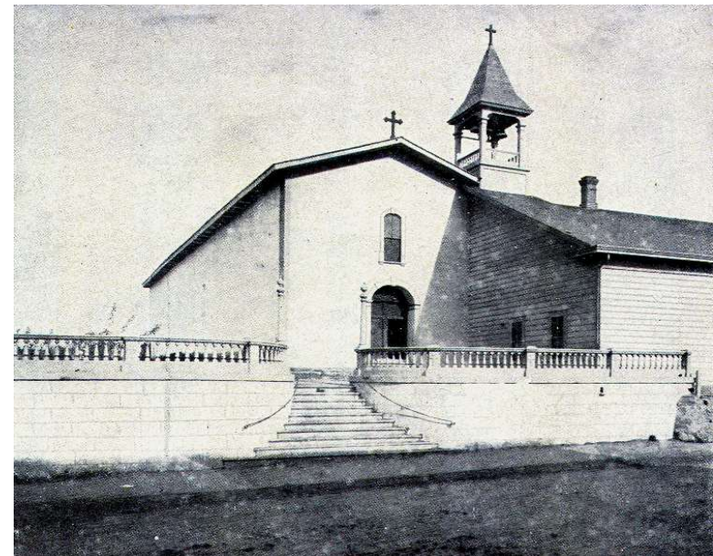
MISSION OF SAN LUIS OBISPO

God," that "most glorious prince" might be induced to care "for bodies as well as souls." While considerable success attended this new venture, the condition of things at San Francisco, on the other hand, continued anything but satisfactory; and a proposal based on these two facts was presently made, that the old mission should be removed entirely from the peninsula, and refounded in a more favorable locality somewhere in the healthy and fertile country beyond San Rafael. It was thus that the name of San Francisco got attached from the outset to the new settlement at Sonoma; and when later on (the old mission being left in its place) this was made into an independent mission, the name was retained, though the dedication was transferred, appropriately enough, from St. Francis of Assisi to that other St. Francis who figures in the records as "the great apostle of the Indies."