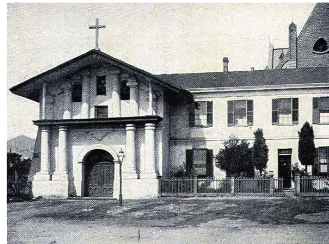
MISSION OF SAN FRANCISCO DE ASSIS (DOLORES)

was to be the mission of San Buenaventura. It was not until 1782, however, that the long-delayed purpose was at length accomplished. The site chosen was at the southeastern extremity of the channel, and close to an Indian village, or rancheria to which Portola's expedition in 1769 had given the name of Ascension de Nuestra Senora , or, briefly, Assumpta . A little later on, in pursuance of the same plan, the then governor, Filipe de Neve, took formal possession of a spot some ten leagues distant, and there began the construction of the presidio of Santa Barbara. It was Junipero's earnest desire to proceed at once with the adjoining mission. But the governor, for reasons of his own, threw obstacles in the way, and in the end this fresh undertaking was left to other hands.