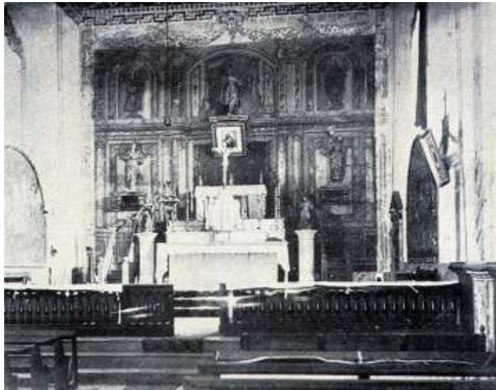
INTERIOR, SANTA BARBARA

made. Further developments of the same general plan which aimed, it will be understood, not alone at the spiritual conquest, but also at the proper control of the new kingdom—were now taken under consideration. And, as a result, five fresh missions were presently resolved upon. One of these was to be situated between San Francisco and Santa Clara; the second, between Santa Clara and Monterey; the third, between San Antonio and San Luis Obispo; the fourth, between San Buenaventura and San Gabriel; and the fifth, between San Juan Capistrano and San Diego. The importance of these proposed settlements as connecting links will be at once apparent, if we observe that by reason of their carefully chosen locations they served, as it were, to put the older missions into actual touch.