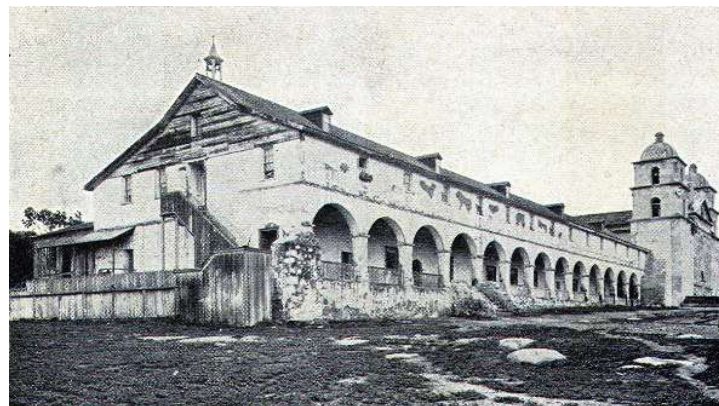
MISSION OF SANTA BARBARA

Soledad, on the west side of the Salinas River, in the vicinity of the present town of Soledad, and about thirty miles from Monterey.