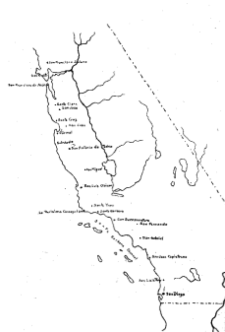
MAP SHOWING LOCATIONS OF MISSIONS

in the obscure darkness of paganism, and to extend the dominion of the King, our Lord, and protect this peninsula from the ambitious views of foreign nations." From the first it was his intention that the Cross and the flag of Spain should be carried side by side in the task of dominating and colonizing the new country. Having, therefore, gathered his forces together at Santa Ana, near La Paz, he sent thence to Loreto, inviting Junipero Serra, the recently appointed President of the California Missions, to visit him in his camp. Loreto was a hundred leagues distant; but this was no obstacle to the religious enthusiast, whose lifelong dream it had been to bear the faith far and wide among the barbarian peoples of the Spanish world. He hastened to La Paz, and in the course of a long interview with Galvez not only promised his hearty co-operation, but also gave great help in the arrangement of the preliminary details of the expedition.