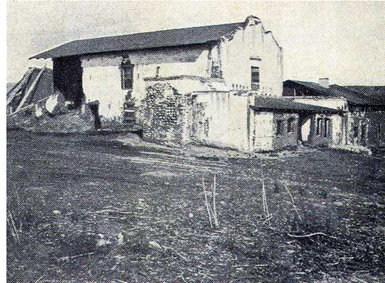
MISSION OF SAN DIEGO

this," he said. "I have placed all my faith in God, through whose goodness I hope to reach not only San Diego, to plant and fix there the standard of the Holy Cross, but even as far as Monterey." And Palou, seeing that Junipero was not to be turned aside, wisely began to talk of other things.