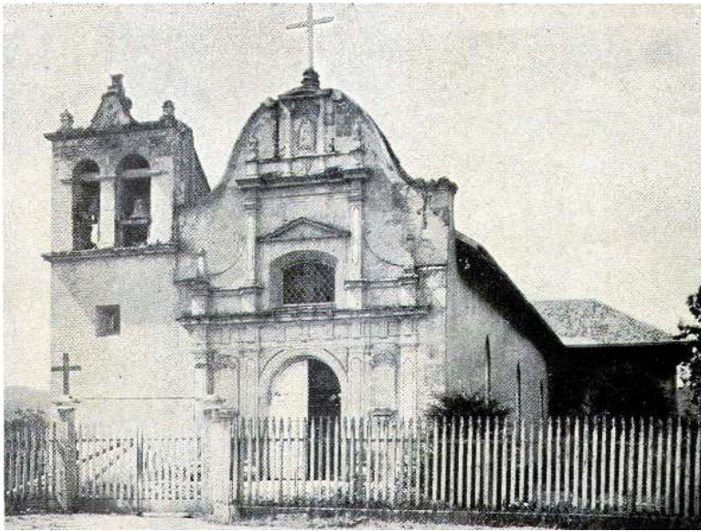
MISSION CHURCH, MONTEREY