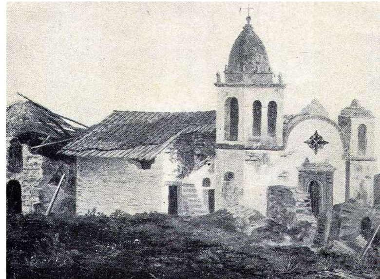
CARMEL MISSION, A NEARER VIEW

There was, none the less, plenty to engage the energies of even so tireless a worker as Junipero, for three of the new missions were successfully established between July, 1771, and the autumn of the following year. The first of these was the Mission of San Antonio de Padua, in a beautiful spot among the Santa Lucia mountains, some twenty-five leagues southeast of Monterey the second, that of San Gabriel Archangel, near what is now known as the San Gabriel river; and the third, the Mission of San Luis Obispo de Tolosa, for which a location was chosen near the coast, about twenty-five leagues southeast of San Antonio.