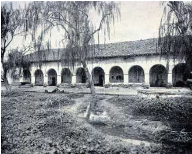
MISSION OF SAN FERANDO

which, at the very best, was narrow and arbitrary. Every vestige of freedom was taken from them when they entered, or were brought into, the settlement. Henceforth they belonged, body and soul, to the mission and its authority. Their tasks were assigned to them, their movements controlled, the details of their daily doings dictated, by those who were to all intents and purposes their absolute masters; and corporal punishment was visited freely not only upon those who were guilty of actual misdemeanor, but also upon such as failed in attendance at church, or, when there, did not conduct themselves properly. From time to time some unusually turbulent spirit would rise against such paternal despotism, and break away to his old savage life. But these cases, we are told, were of rare occurrence. The California Indians were for the most part indolent, apathetic, and of low intelligence; and as, under domestication, they were clothed, housed and fed, while the labour demanded from them was rarely excessive, they were wont as a rule to accept the change from the hardships of their former rough existence to the comparative comfort of the mission, if not exactly in a spirit of gratitude, at any rate with a certain brutal contentment.