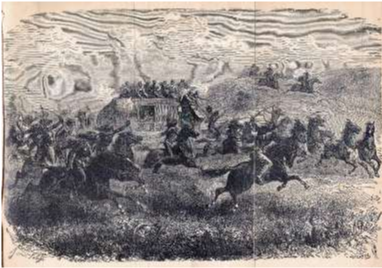
THE OVERLAND MAIL