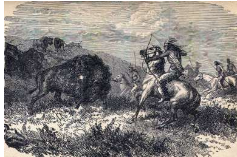
INDIANS HUNTING BUFFALO.

Thus fifteen years passed away. Civilization made gradual encroachments. Quite a little cluster of log huts was reared in the vicinity, where the inmates in case of necessity could flee to the fort for protection. Christopher, at fifteen years of age, was an unlettered boy, small in stature, but very fond of the solitude of the forest, and quite renowned as a marksman. He was amiable in disposition, gentle in his manners, and in all respects a good boy. He had a strong character. Whatever he undertook, he quietly and without any boasting performed. With sound judgment, and endowed with singular strength and elasticity, he was even then deemed equal to any man in all the requirements of frontier life.