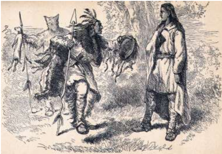
INDIAN MEDICINE MAN.

This Indian, one night, selected six of the fleetest horses, and mounting one and leading the rest, with his stolen property, disappeared over the trackless waste. It was a sum total loss of twelve hundred dollars. But the immediate pecuniary loss was not all, for the horses could not easily be replaced, and without them all the movements of the trapping party were greatly crippled. Mr. Robidoux, knowing Kit Carson's reputation for sagacity and courage, immediately applied to him to pursue the Indian. It was just one of those difficult and hazardous enterprises which was congenial to the venturesome spirit of Carson.