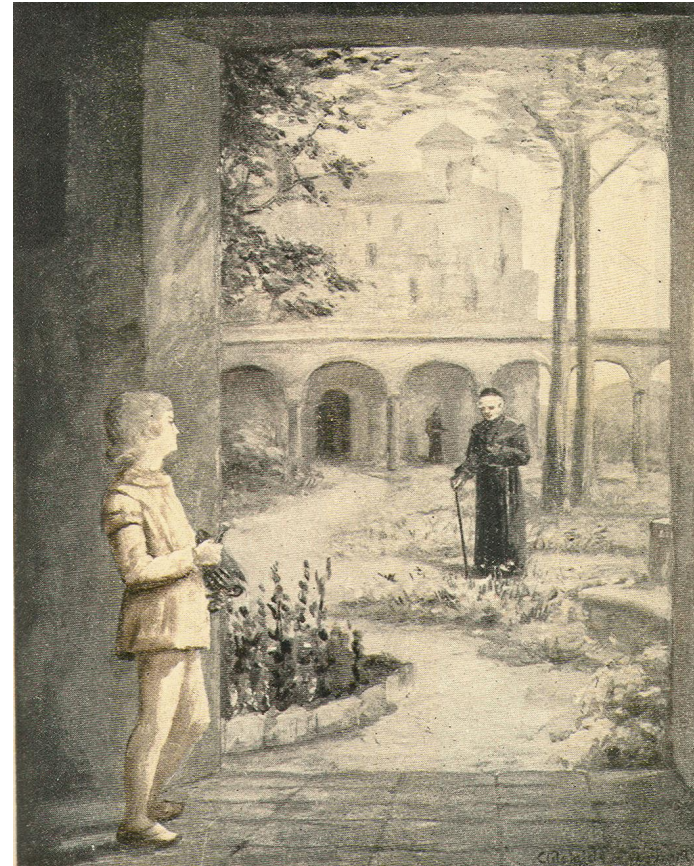
"He saw the Abbot walking up and down"

instead, they used real gold, which they ground up very fine in earthen mortars, and took much trouble to properly prepare. And when they wanted to lay it on, they commonly used the white of a fresh egg to fasten it to the parchment.