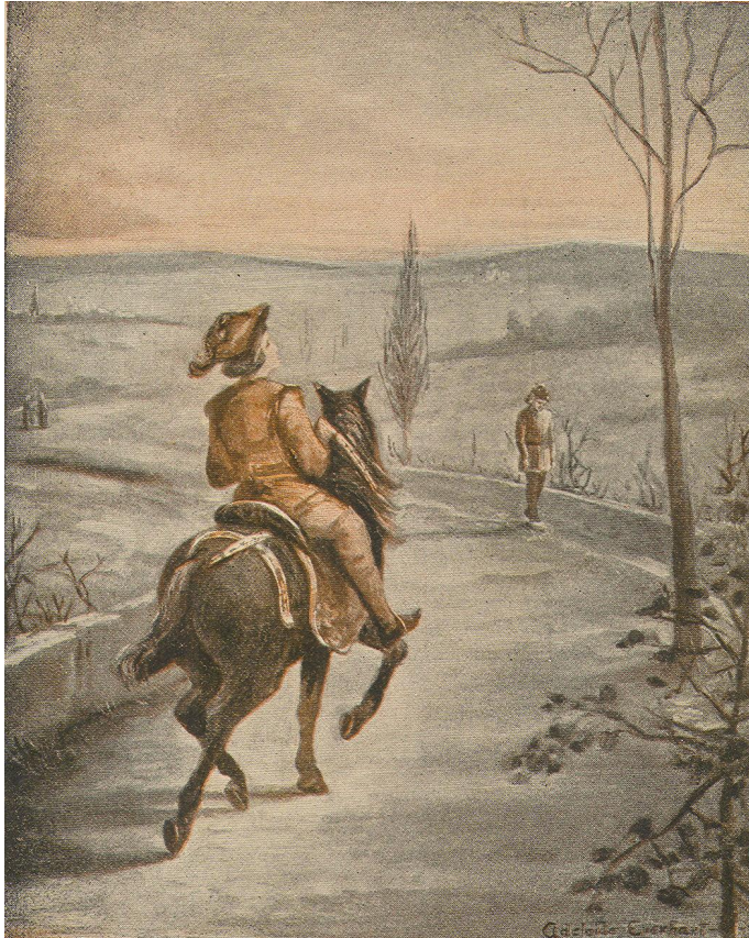
"He passed a little peasant boy"

house, their eyes filled with happy tears, and in their hearts a great tenderness for the little son who had brought help to them.