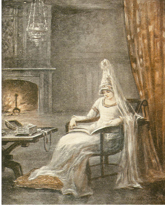
"Began slowly to turn over the pages"

For King Louis had been entirely right in thinking nothing would please the Lady Anne quite so much as a piece of fine illumination.