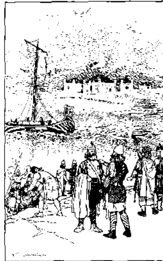
"Those Icelanders clapped them on the shoulders"

and put new gold on it, so that it stood there a glittering dragon with head raised high, looking over the water. Old Sighvat lifted a huge stone and carried it to the ship's side. With all his strength he threw it into the bottom. The timbers cracked.