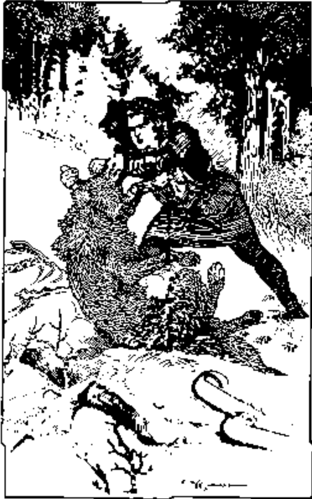
"He drove it into the wolf's neck"

wink he had it out and was striking with it. He drove it into the wolf's neck and threw him back on the snow, dead.