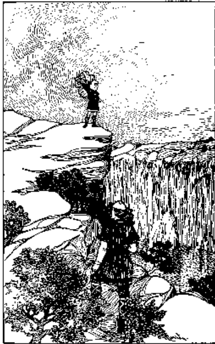
"He threw back his cape and drew a little dagger from his belt"

I am not afraid. But after all, this is a baby thing! When I am eight years old I will have a sword, a sharp tooth of war."