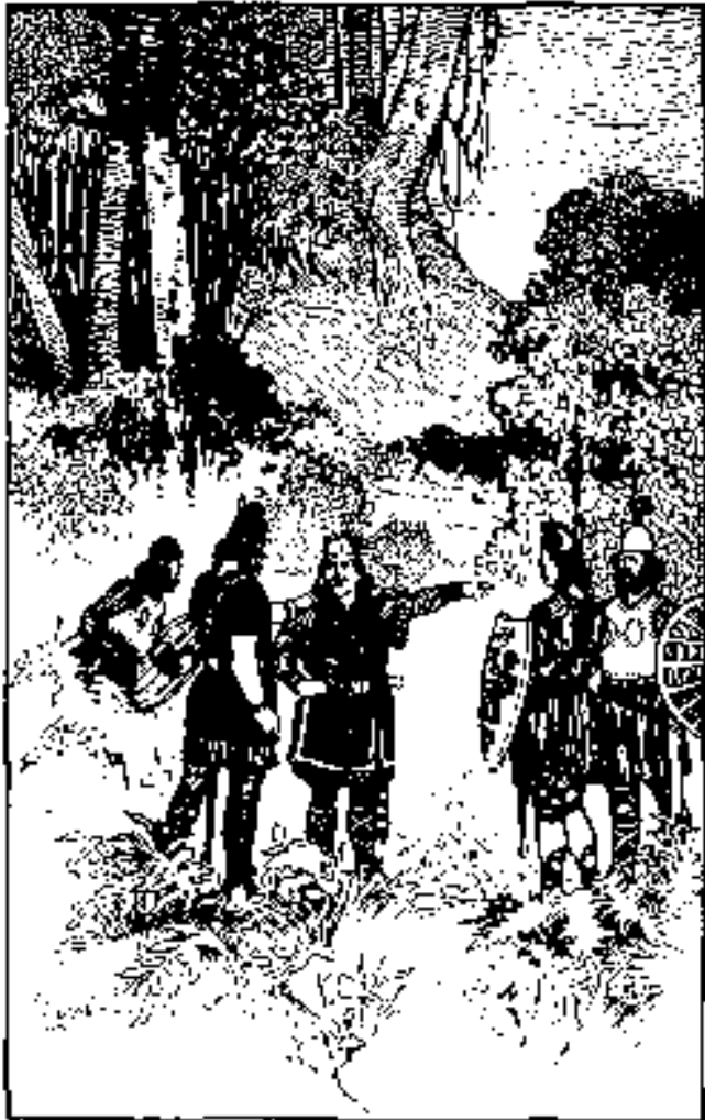
"He pointed to the woods and laughed and rolled his eyes"

They stayed many days in this country and walked about to see what was there. A German, named Tyrker, was with Leif. He was a little man with a high forehead and a short nose. His eyes were big and rolling. He had lived with Eric for many years, and had taken care of Leif when he was a little boy. So Leif loved him.