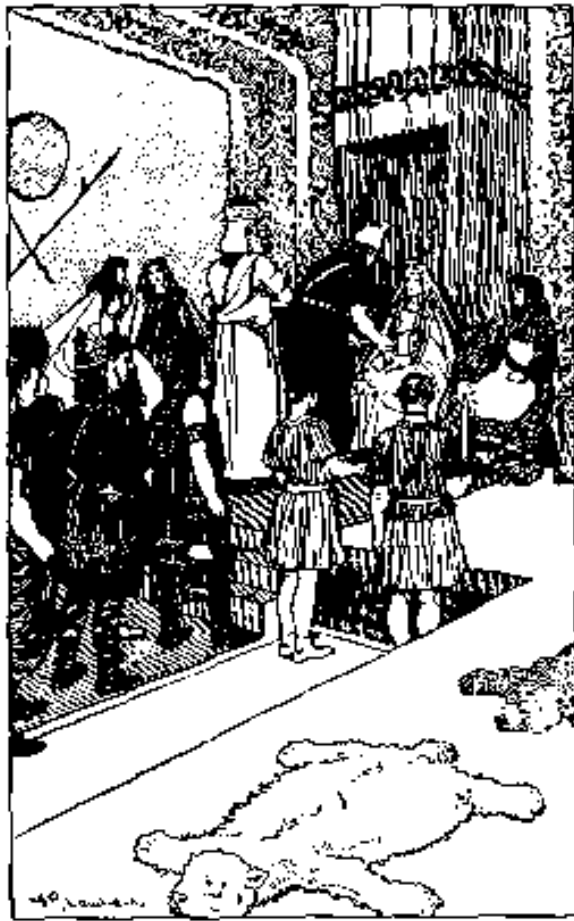
"I, Harald, King of Norway, take you, Gyda, for my wife"

All along the line of boats men fought for hours. In some places the cables had been cut, and the boats had drifted apart. Ships lay scattered about two by two, fighting. Many boats sank, many men died, some fled away in their ships, and at the end King Harald had won the battle. So he had King Arnvid's country and King Audbiorn's country. Many men took the oath and became his friends. All people were talking of his wonderful battles.