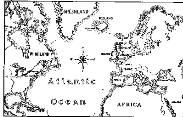
A map showing the journeys of the Vikings