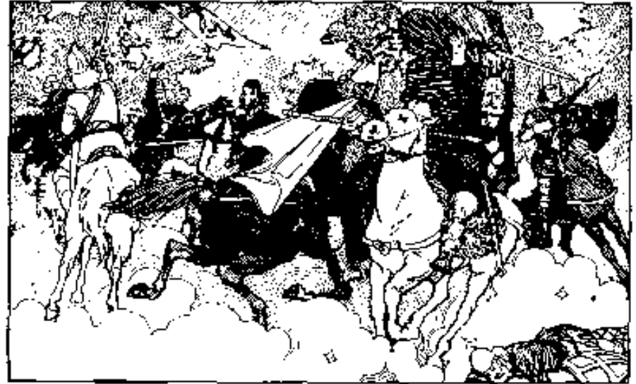
"King Haki fell dead under 'Foe's-fear' "

"Up with the war shield!" shouted King Harald. "Horns blow!"