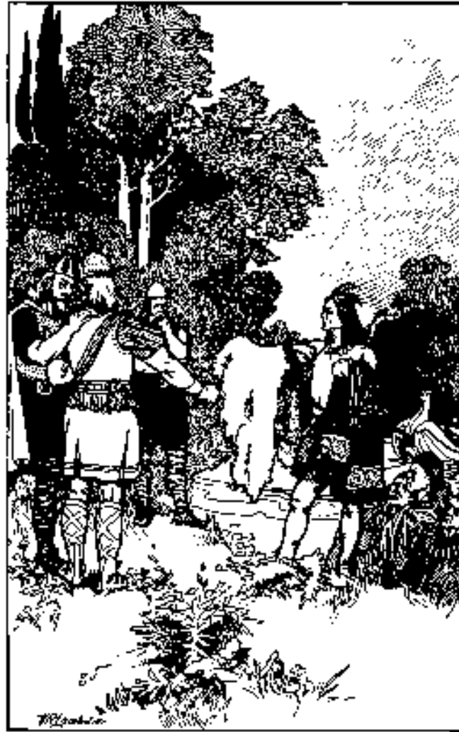
"The chief held them out to Thorfinn and hugged the cloak to him"

"If they want red stuff, I have a whole roll of red cloth that I will trade," one of the other men said.