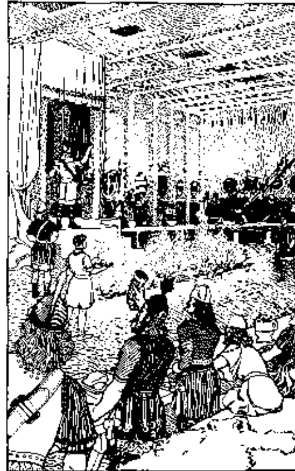
"More than half the men in the hall jumped to their feet"

week or more they stayed in his woods, sometimes in a secret cave of his when they knew that Thorgest was about. And sometimes Eyjolf sent and said: