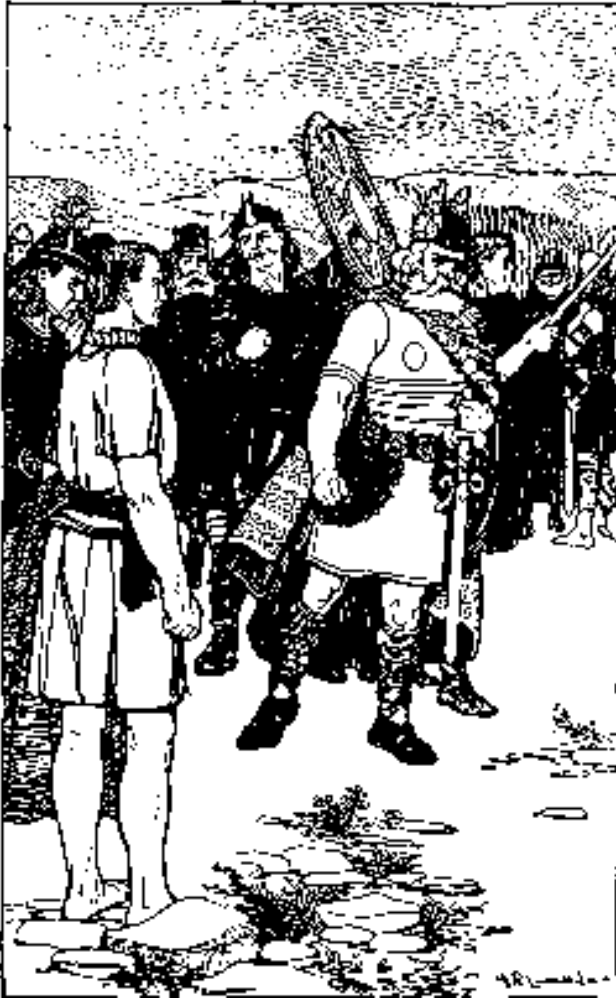
"He looked straight ahead of him and scowled"

"He is in a black temper," they said. "We should best not talk to him."