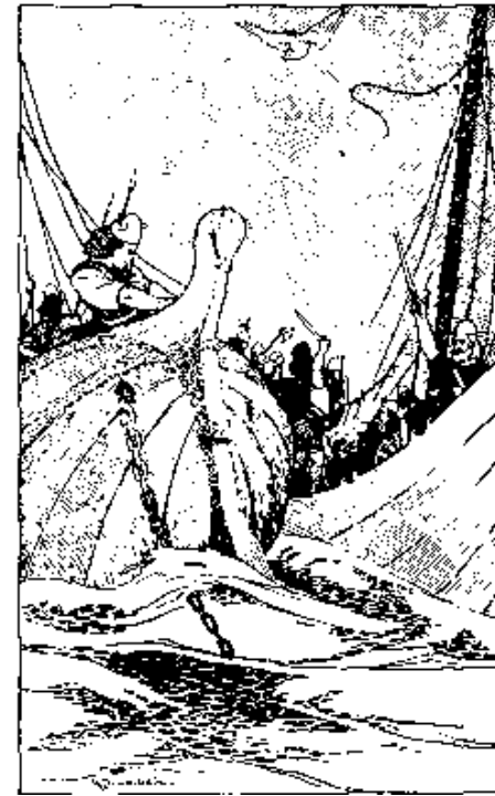
"Then he leaped into King Arnvid's boat"

But Harald's sword struck him, and he fell dead. Then a big, bloody viking of King Arnvid leaped upon the edge of the ship and stood there. He held his drinking-horn and his sword high in his hands.