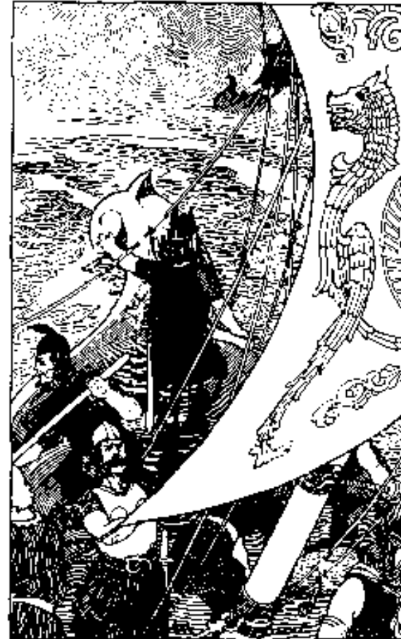
"Then he saw Leif's ship was being driven afar off"

The floor was clean with sweet-smelling pine-branches. Now look at this mean house; its dirt floor, its bare stone walls, its littleness, its darkness! Look at our long faces. No one here could make a song if he tried. Oh! I am sick for dear old Norway."