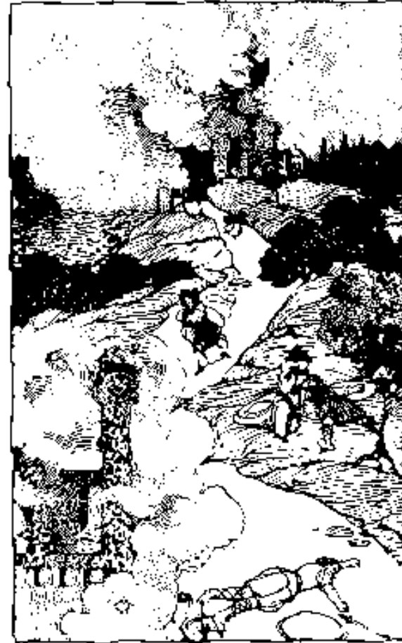
"In Norway they left burning houses and weeping women"

"It is like being always in a boat," they said. "This shall be our home."