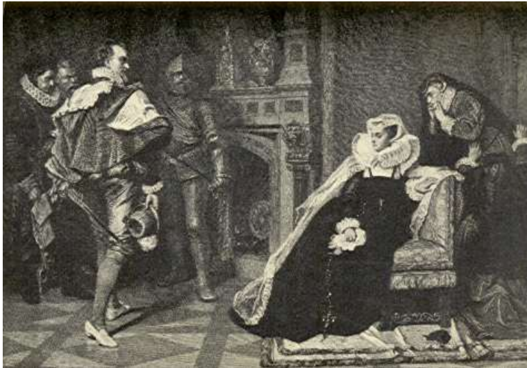
Mary Stuart receiving her death sentence.— From painting by Carl Piloty.

"What is that to me?" cried Elizabeth. "They who murder must expect to be called murderers."