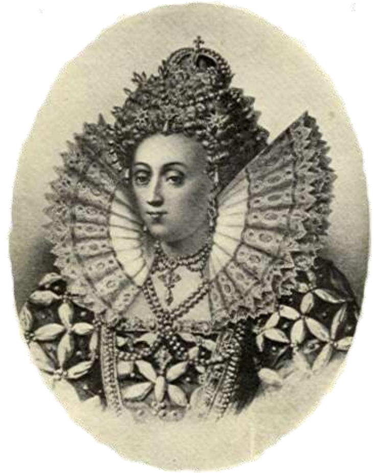
ELIZABETH, QUEEN OF ENGLAND.