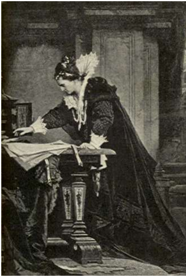
Elizabeth signing the death warrant of Mary Stuart.— From painting by Liezen-Mayer.