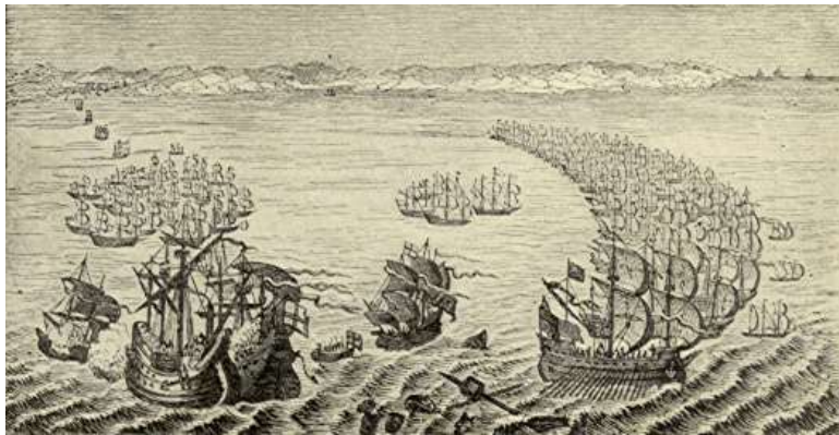
The Spanish Armada attacked by the English Fleet.

low that it was difficult to train the Spanish guns upon them, moreover, the Spaniards were not good marksmen. They would have had a better chance, however, if the English had only been willing to stand still and be fired at, but the Spanish were much surprised and disgusted when the saucy little English craft slipped up under their very bows, fired a shot or two and were away firing at the next ship before the Spanish guns could be trained upon them. Some of the little boats sailed the whole length of the crescent, firing at every vessel and coming off without a scar.