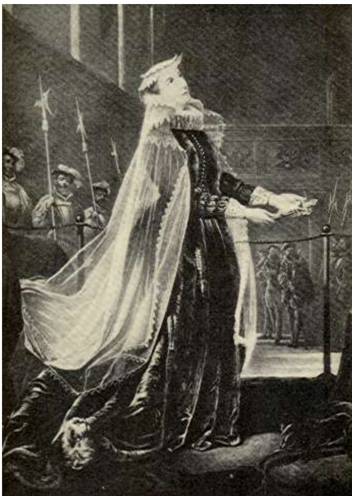
Last moment of Mary, Queen of Scots.— From painting by an unknown artist.

"Even a Tudor queen was not free to follow her own will. The English council had urged the deed for many years."