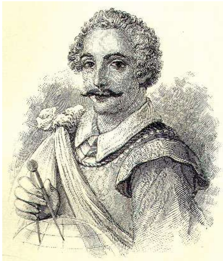
THOMAS CAVENDISH THE SECOND ENGLISHMAN TO CIRCUMNAVIGATE THE GLOBE.

An account has been left us by Governor Lane himself of the transactions at Roanoke after the departure of Grenville, which is apathetic narrative of sufferings sturdily endured and obstacles continually removed, only to be repeatedly encountered.