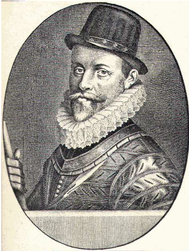
SIR JOHN HAWKINS

to bring her to port, and so returned to England without her. From this adventure toward America Raleigh emerged with the loss of some capital, and yet with his faith unshaken in the eventual success of such enterprises.