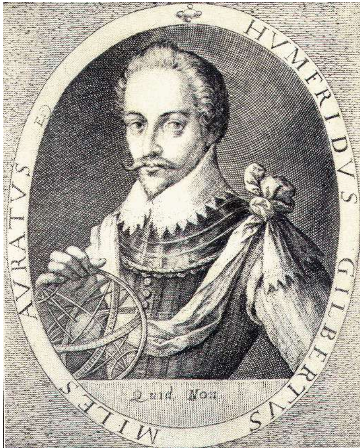
SIR HUMPHREY GILBERT

genuine and of great value; yet he had continued hopeful to the last.