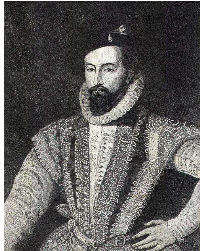
SIR WALTER RALEIGH.

enemies but friends, when it was discovered that they had come from Croatan to gather their harvests of corn. Thus the vengeful deed miscarried, and yet was the means of adding to the rancor felt in Indian breasts toward the English intruders.