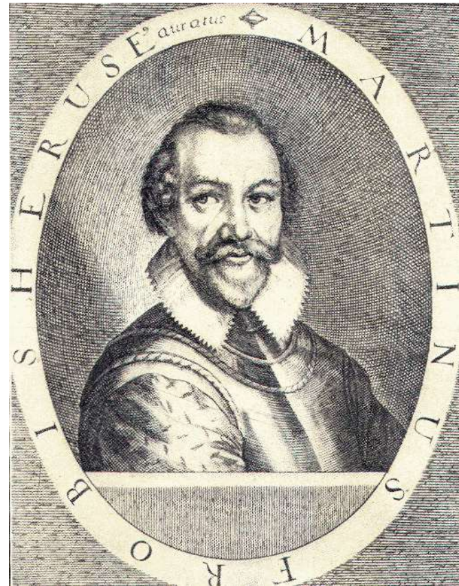
SIR MARTIN FROBISHER.

The squadron that went off to hold the Spanish war-ships in check was placed by Raleigh under the command of Sir Martin Frobisher; the other he gave to Sir John Borough, and then, having made every arrangement possible that could conduce to success, he returned to England (though not without misgivings and protests), in obedience to the Queen's command. Whether he knew what was in store for him, or whether he was wholly ignorant of his capricious sovereign's intentions, does not fully appear; but from a letter which he had written to Sir Robert Cecil, on March loth preceding, one might infer that he had at least an inkling of what was disturbing her Majesty: