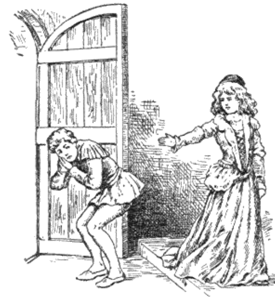
KATHARINE BOXES THE SERVANT'S EARS.

And, after the marriage, when should have been the wedding breakfast, Petruchio carried his wife away, not allowing her to eat or drink—saying that she was his now, and he could do as he liked with her.