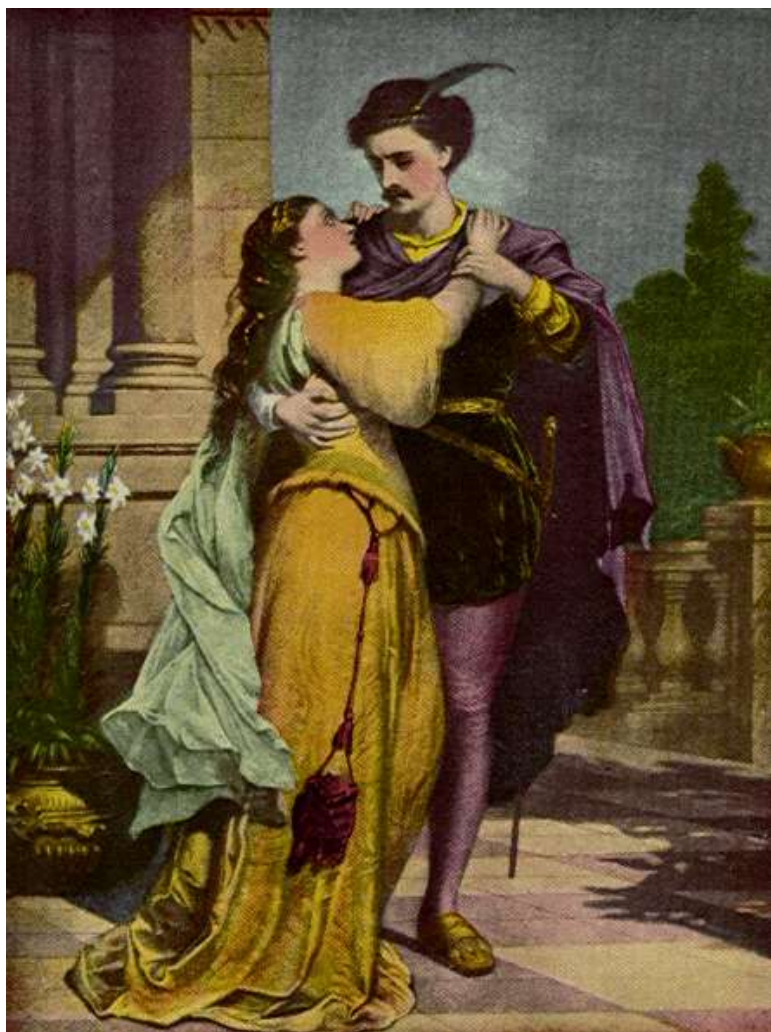
ROMEO AND JULIET

Then Juliet said to her nurse: "Who is that gentleman that would not dance?"