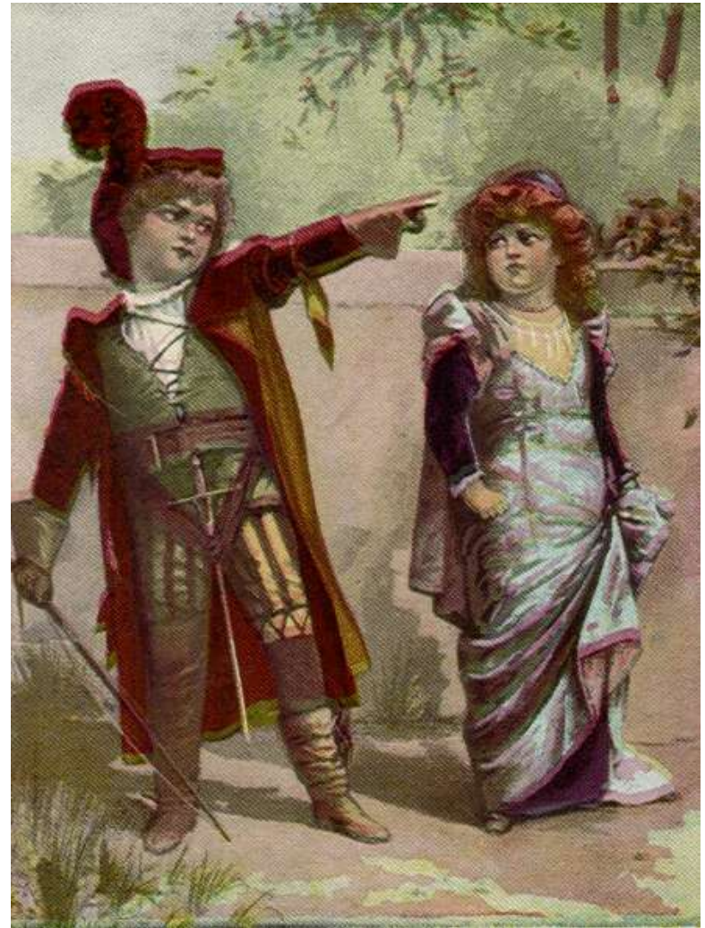
PETRUCHIO AND KATHERINE

"Oh, no," said Petruchio, "they call you plain Kate, and bonny Kate, and sometimes Kate the shrew, and so, hearing your mildness praised in every town, and your beauty too, I ask you for my wife."