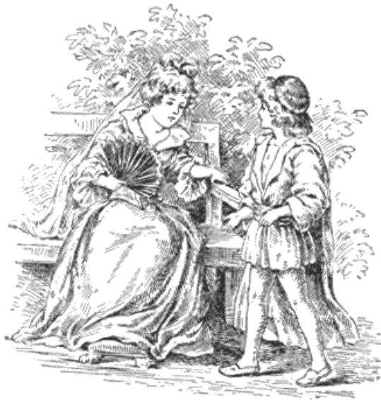
VIOLA AS "CESARIO" MEETS OLIVIA.

was drowned, Sebastian, as dear to her as the heart in her bosom, and so like her that, but for the difference in their manner of dress, one could hardly be told from the other. The captain, for her comfort, told her that he had seen her brother bind himself "to a strong mast that lived upon the sea," and that thus there was hope that he might be saved.