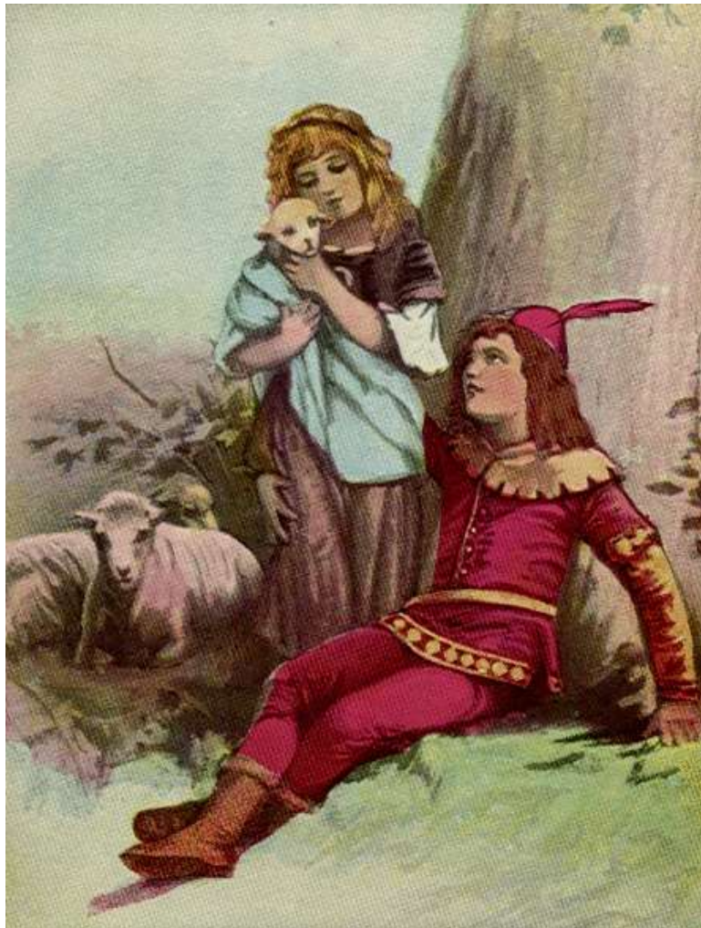
PRINCE FLORIZEL AND PERDITA

The baby Princess was left on the seacoast of Bohemia, the very kingdom where Polixenes reigned. Paulina's husband never went home to tell Leontes where he had left the baby; for as he was going back to the ship, he met a bear and was torn to pieces. So there was an end of him.