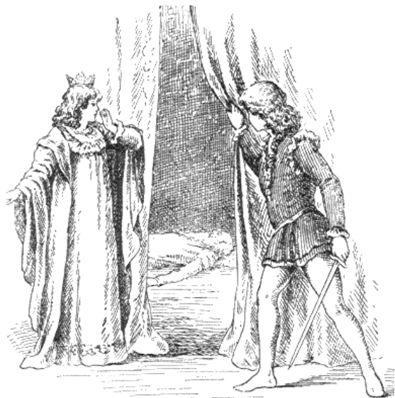
POLONIUS KILLED BY HAMLET.

"Now I am sure the ghost spoke true. For if Claudius had not done this murder, he could not have been so distressed to see it in a play."