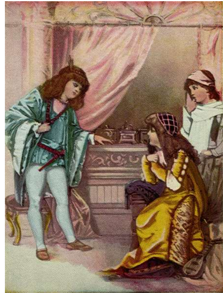
CHOOSING THE CASKET

only accept that suitor who would pledge himself to abide by the terms of her father's will. These were conditions that frightened away many an ardent wooer. For he who would win Portia's heart and hand, had to guess which of three caskets held her portrait. If he guessed aright, then Portia would be his bride; if wrong, then he was bound by oath never to reveal which casket he chose, never to marry, and to go away at once.