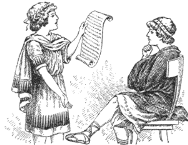
POET READING TO TIMON.