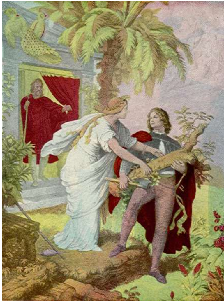
FERDINAND AND MIRANDA

have carried out their wicked purpose while their victim was asleep, but that Ariel woke him in good time.