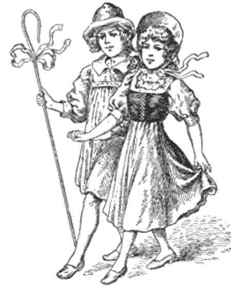
ROSALIND AND CELIA