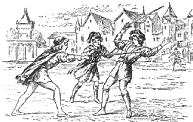
ROMEO AND TYBALT FIGHT.