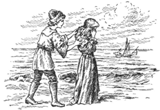
VIOLA AND THE CAPTAIN.