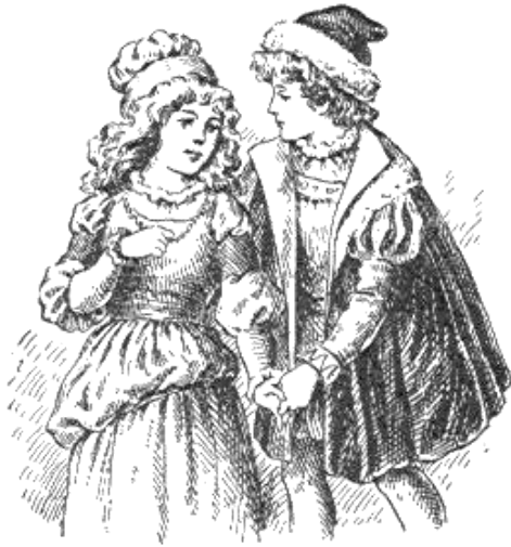
CLAUDIO AND HERO.