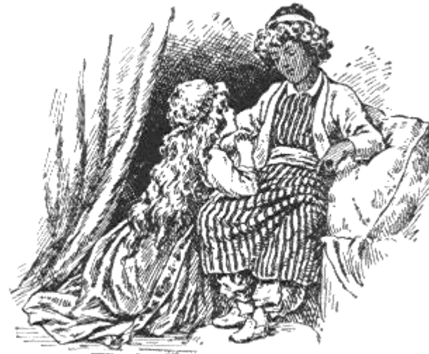
OTHELLO TELLING DESDEMONA HIS ADVENTURES.