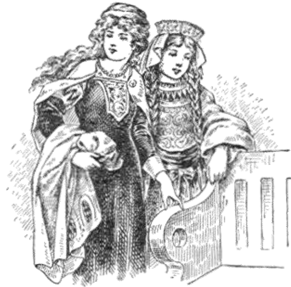
GONERIL AND REGAN.

"I am your daughter," she went on, "and you have brought me up and loved me, and I return you those duties back as are right and fit, obey you, love you, and most honor you."