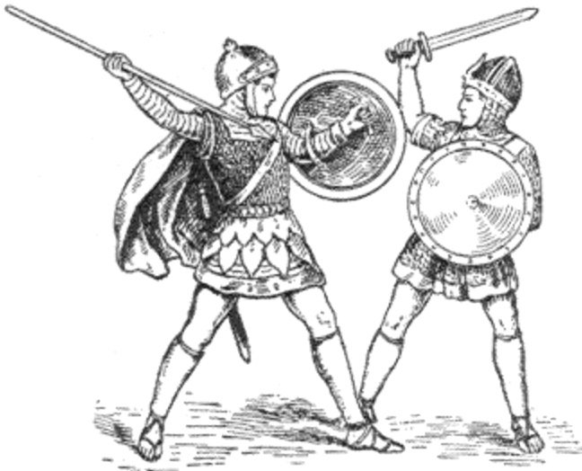
MACBETH AND MACDUFF FIGHT.

Macbeth had still his courage. He went to battle to conquer or die, and the first thing he did was to kill the English general's son in single combat. Macbeth then felt that no man could fight him and live, and when Macduff came to him blazing for revenge, Macbeth said to him, "Go back; I have spilt too much of your blood already."