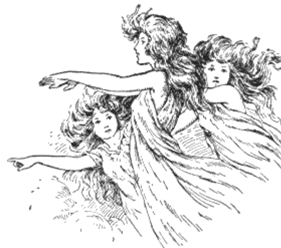
THE THREE WITCHES.