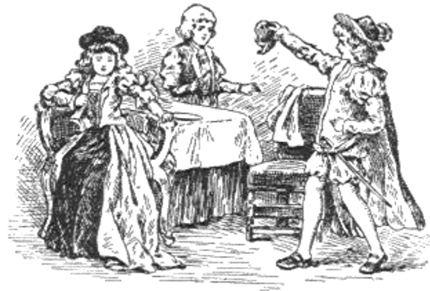
PETRUCHIO FINDS FAULT WITH THE SUPPER.

and cap that the tailor had made for her, but Petruchio found fault with everything, flung the cap and gown on the floor vowing his dear wife should not wear any such foolish things.