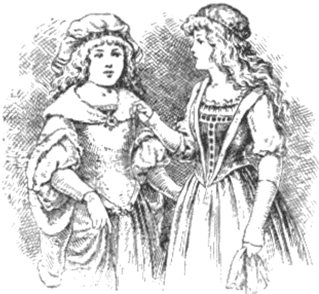
HELENA AND THE WIDOW.

ring, which he thought Diana had given him, came to be so like Helena's.