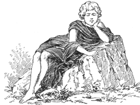
TIMON GROWS SULLEN.

"You have done so," sneered Apemantus. "Will the cold brook make you a good morning drink, or an east wind warm your clothes as a valet would?"