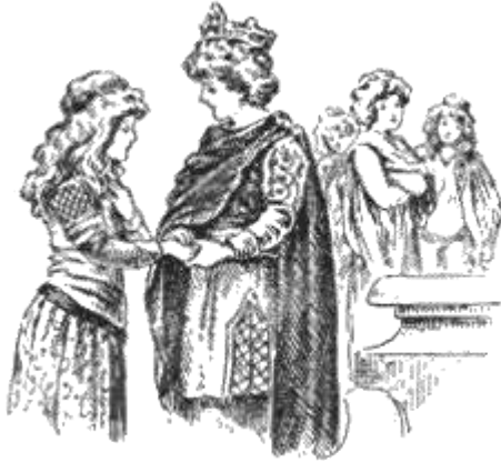
CORDELIA AND THE KING OF FRANCE.