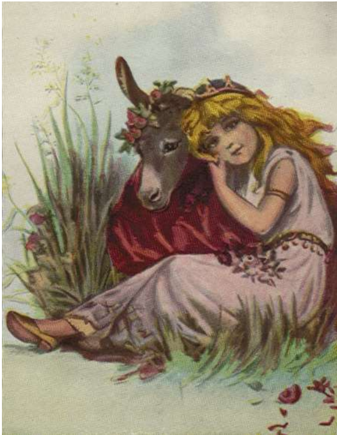
TITANIA AND THE CLOWN

fairies, Oberon and Titania. Now fairies are very wise people, but now and then they can be quite as foolish as mortal folk. Oberon and Titania, who might have been as happy as the days were long, had thrown away all their joy in a foolish quarrel. They never met without saying disagreeable things to each other, and scolded each other so dreadfully that all their little fairy followers, for fear, would creep into acorn cups and hide them there.