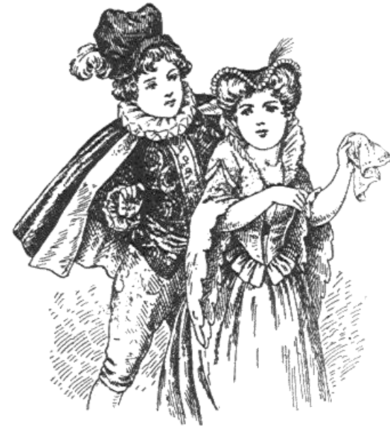
CASSIO GIVES BIANCA THE HANDKERCHIEF.

"Why, sweet Othello?" she asked, sarcastically; and Othello slapped her face.