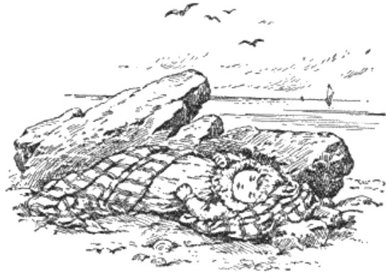
LEFT ON THE SEA-COAST.