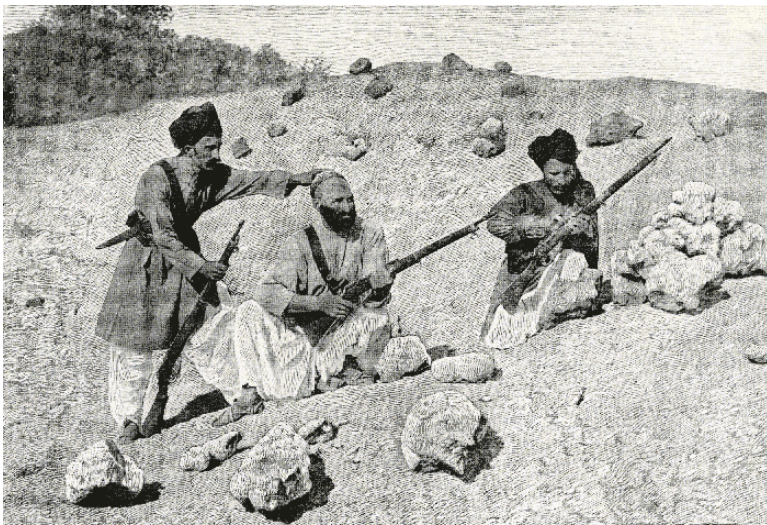
AFRIDIS ON THE WAR-PATH.

with him was Lumsden with the Guides. Among the recalcitrants was the village of Babuzai, situated in a strong position in the Lundkwar Valley, and Lawrence determined promptly to coerce it. His plan of operation was to send the Guides' infantry by night to work along the hills, so that before daylight they would be occupying the commanding heights behind the village, and thus cut off escape into the mountains. He himself, at dawn, would be in position with the Sikh brigade to attack from the open plain; while the Guides' cavalry were disposed so as to cut off the retreat to the right up the valley.