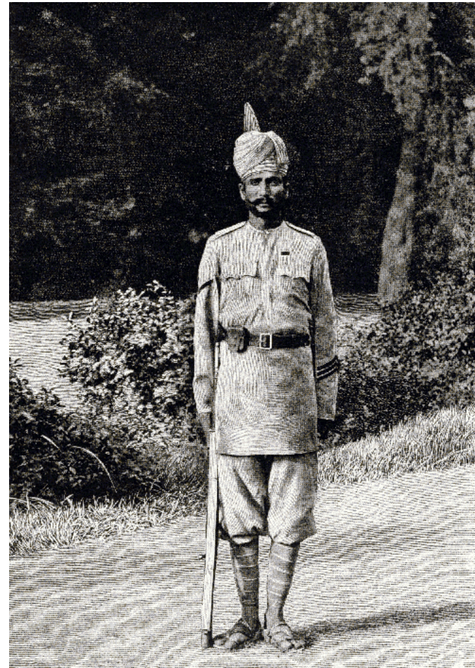
A NON-COMMISSIONED OFFICER OF THE GUIDE'S INFANTRY.

leader should be. Commanders of regiments come and go, and few leave their mark; but over the Guides the influence of Lumsden still burns bright and clear. To be alert and ready; to rise equal to the occasion, be the call small or great; to be not easily taken aback in a sudden emergency; to be a genial comrade and a good sportsman,—such are the simple soldier maxims left to his comrades by one of the best soldiers who ever drew sword.