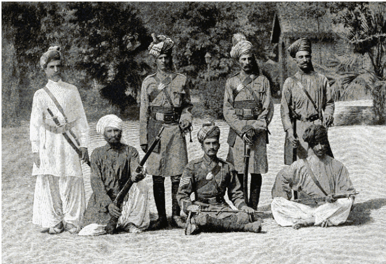
TYPES OF MEN IN THE GUIDES' CAVALRY, BOTH IN UNIFORM AND MUFTI.

apparent. By dint of living for years as Asiatics, exceptional linguists like Vambery and Burton have undoubtedly been able to pass unchallenged, but anyone possessing qualities short of theirs must inevitably be discovered a dozen times a day. The way we eat and drink, the way we walk and sit, the way we wear our clothes and boots, the way we wash,—every little thing is absolutely different from the methods and manners of the East.