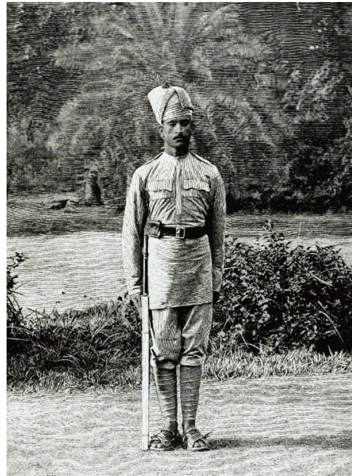
AN AFRIDI OF THE GUIDES' INFANTRY.