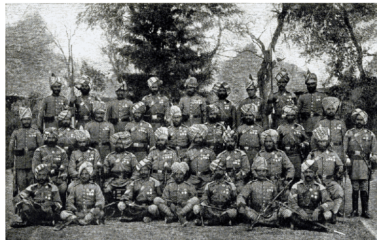
THIRTY-FOUR WEARERS OF THE STAR "FOR VALOUR," ALL SERVING AT ONE TIME IN THE CORPS OF THE GUIDES. THIS IS THE HIGHEST DISTINCTION OPEN TO AN INDIAN SOLDIER FOR GALLANTRY IN ACTION. THE GROUP ILLUSTRATES THE VARIETY OF TRIBES ENLISTED IN THE GUIDES—AFRIDIS, YUSAFZAI PATHANS, KHUTTUCKS, SIKHS, PUNJABI MOHAMEDANS, PUNJABI HINDUS, FARSIWANS (PERSIANS), DOGRAS, GURKHAS, KABULIS, TURCOMANS, &C., &C., MOST OF WHOM ARE HERE REPRESENTED.