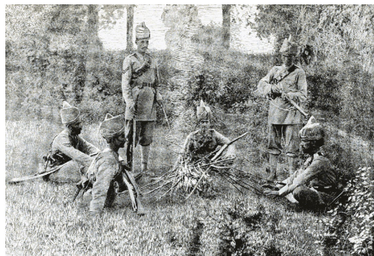
A PICQUET OF THE GUIDE'S INFANTRY BIVOUACKING.