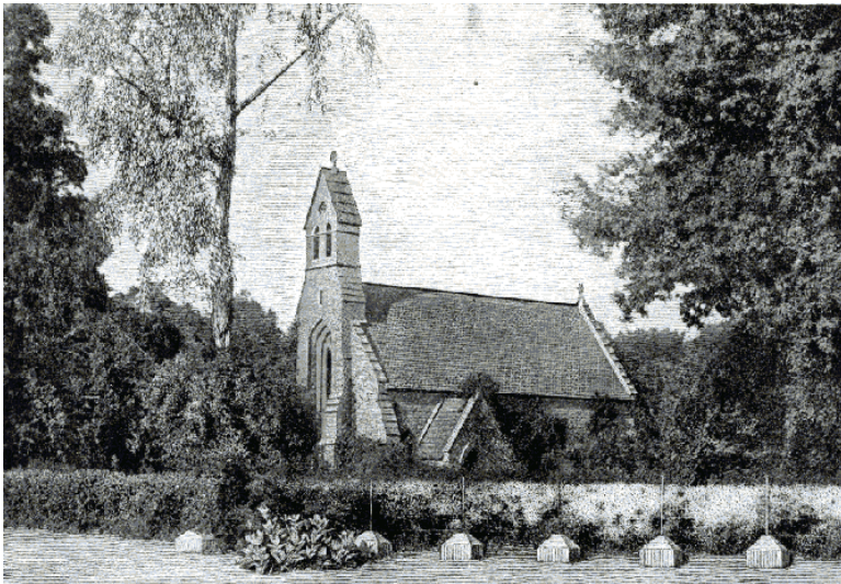
THE CHURCH AT MARDAN.

The daily life at Mardan is much the same as in any other Indian cantonment. In the early morning comes parade or manoeuvre, growing painfully early as the brief hot weather creeps on. Stables follow for the cavalry, and work in the lines for the infantry. Next comes orderly-room for the adjutants and others; and twice a week darbar . The darbar in an Indian regiment takes the place of the formal orderly-room of a British regiment. It is held in the open, under the trees, or at any convenient spot; and the underlying principle is that any man in the regiment may be present to hear, and, when called upon, to speak. It is a sort of open court, whereat not only are delinquents brought up for judgment, but all matters connected with the welfare of the men, and especially such as in any way touch their pockets or privileges, are openly discussed. To add to the semi-informal and friendly nature of the assembly, all the men are allowed to wear plain clothes.