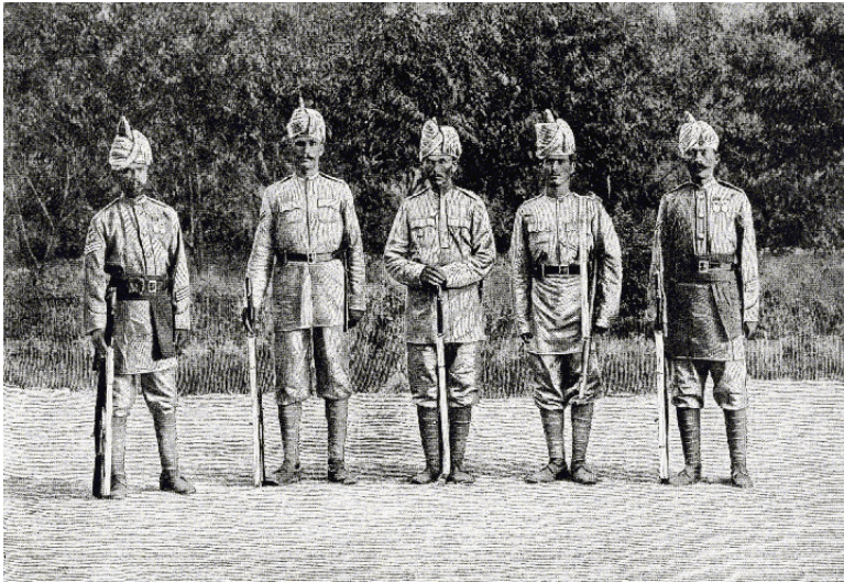
TYPES OF MEN IN THE GUIDES' INFANTRY.

relations and friends. Amongst these men was a young Afridi soldier, who was sore puzzled what to do. His own village lay right in the path of the army, and only a few miles distant; his relations and friends came daily to visit him, urging him to take his discharge and return to his own people before the war began. Was anyone ever in a more awkward position?