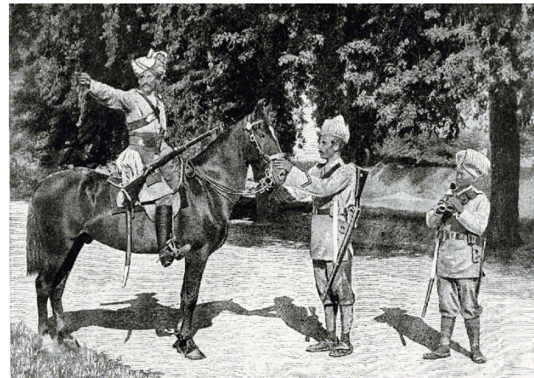
A SCOUT OF THE GUIDES' CAVALRY WARNING HIS INFANTRY COMRADES. THE SMALL MAN ON THE RIGHT IS A GURKHA.