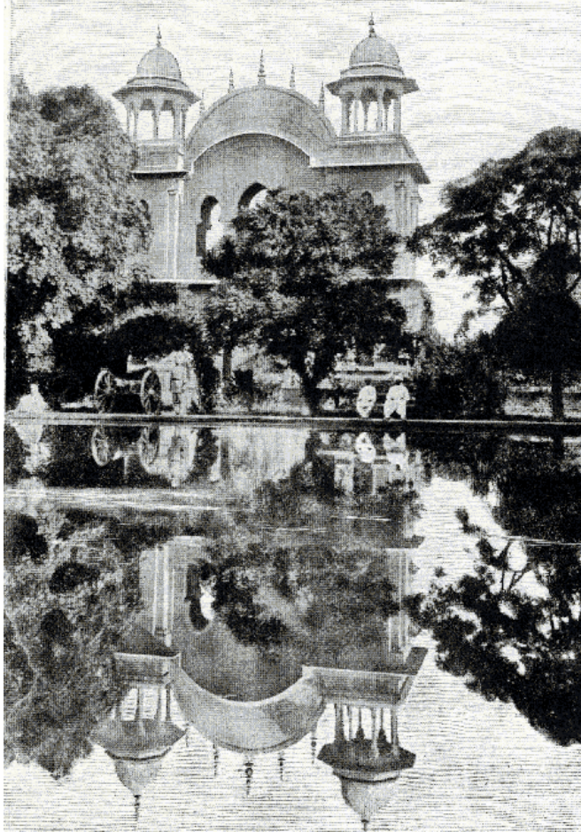
THE MEMORIAL ARCH AND TANK TO THE MEMORY OF SIR LOUIS CAVAGNARI AND THE OFFICERS AND NON-COMMISSIONED OFFICERS AND MEN OF THE GUIDES KILLED IN THE DEFENCE OF THE KABUL RESIDENCY, SEPTEMBER 3, 1879

sullen mood. The finances of the State were in a chaotic condition, the treasury at low ebb, and credit had receded to a vanishing point. After staving off the day of reckoning as long as possible, the welcome news reached the Herati troops that they were to receive their pay in full next morning, September 3rd, at the treasury in the Bala Hissar.