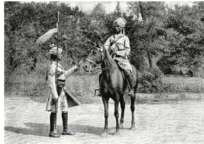
NON-COMMISSIONED OFFICER AND TROOPER OF THE GUIDES' CAVALRY.