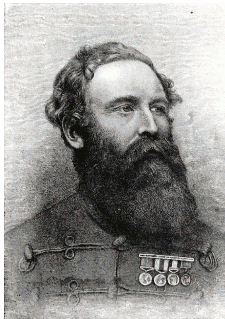
SIR HARRY LUMSDEN, WHO RAISED THE GUIDES FROM A PORTRAIT MADE WHEN HE WAS COMMANDING THE CORPS.