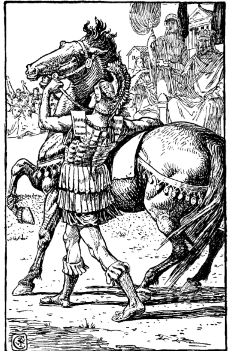
ALEXANDER TAMING BUCEPHALUS

"Seek another kingdom, my son, for Macedonia is too small for thee!"