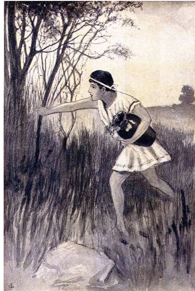
AT LAST HE REACHED THE TOP OF THE LITTLE PATH.

In the distance he heard a slight crackling. It was the sound of footsteps in the grove. The slave was doubtless returning.