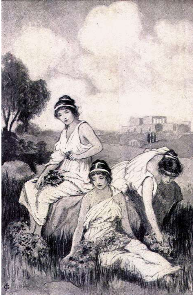
THE GIRLS MADE A BEAUTIFUL PICTURE WITH THEIR LIGHT DRAPERIES AND FRESH FLOWERS.

"Because," replied Gorgo, "they think it strange that we take part in the contests and the choruses. In Athens, only the men take part. The girls must stay at home. And when they do go upon the street, they must wear veils over their faces, and speak to no one."